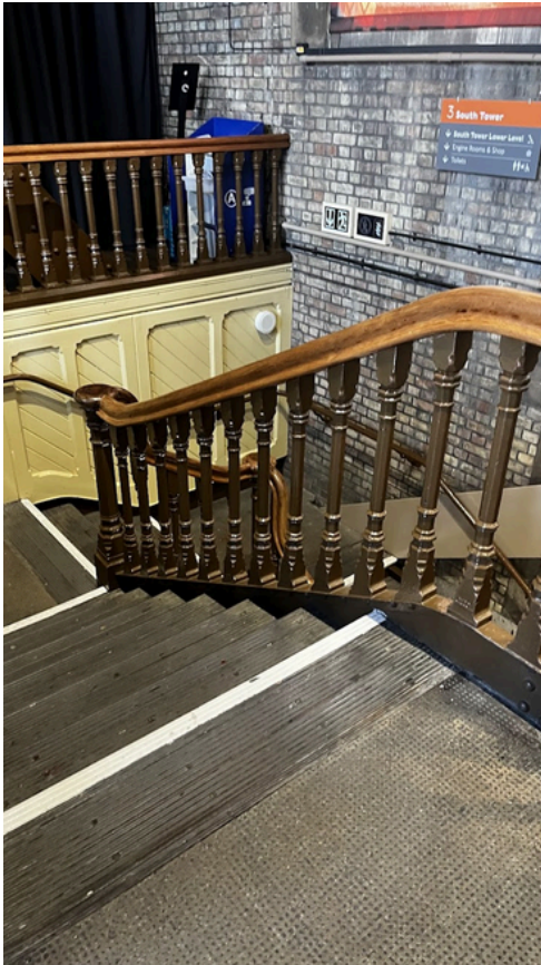
South Staircase (approximately 200 steps)

Once you have seen both Walkways and Towers you have two options to exit the Towers.